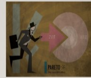
Q1 2023 MRC Pareto Submittals